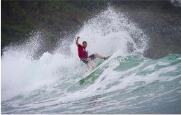
Glenn Hall Ireland ASP Top 36. Winner of the 1st edition of the Hainan Classic on 2012