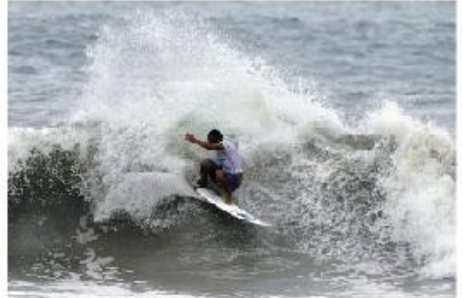
Sunny García Hawaii 2000 ASP World Tour Champion, 2012 Nicaragua World Master Surfing Championship Gold Medalist on the Grand Master Division.