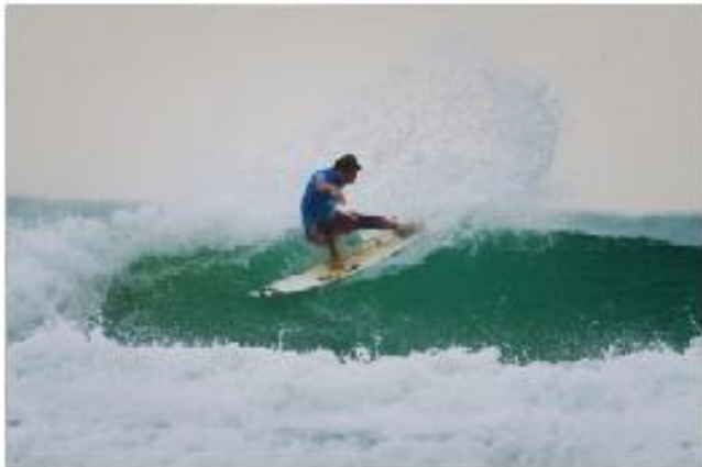
Cory Lopez United States Silver Medalist at the 2009 ISA World Surfing Games and at the 2012 ISA China Cup, 3-Time ESPN X-Games Gold Medalist